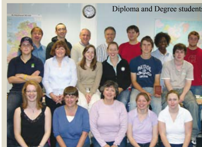
Diploma and Degree students